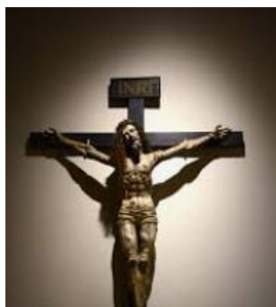
Let us always remember our deceased Knights